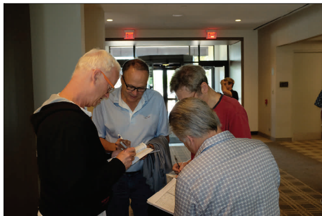
Team Wolfson comparing in the hall

Several Committees of the USBF meet online as Forums on BridgeWinners. These groups impact future United States Bridge Championships. Among these committees are the USBF Tournament Policy Committee , the USBF Technical Committee , and the USBF Systems Committee . These committees formerly known as the ITT committees make decisions that impact you as participants in our Competitions.